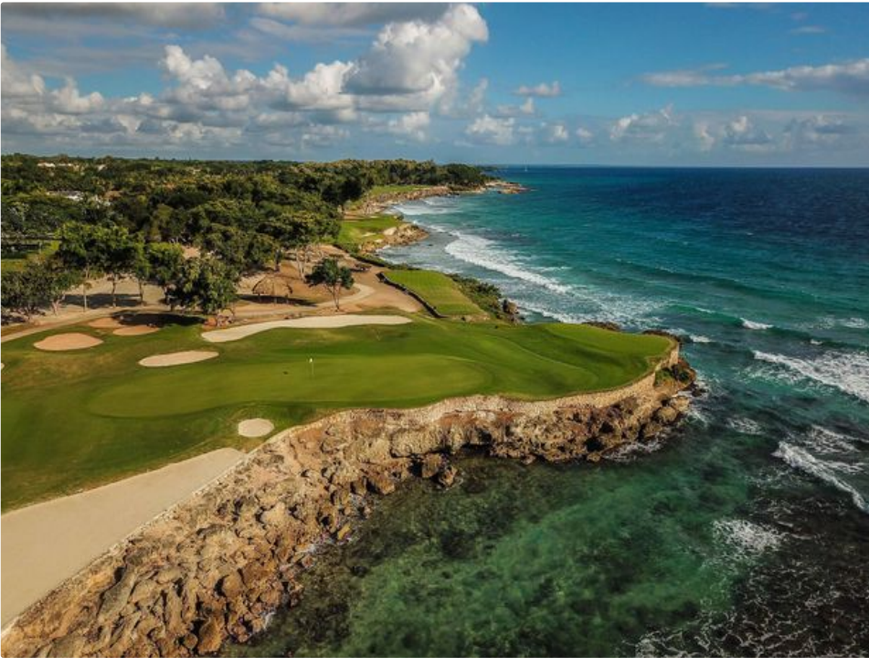
Teeth of the Dog at Casa de Campos in the Dominican Republic. Teeth of the Dog at Casa de Campos

By John Scott Lewinski Updated Sept. 18, 2021 7:43 pm ET