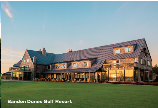
Bandon Dunes Golf Resort