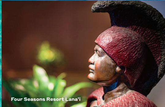
Four Seasons Resort Lana'i