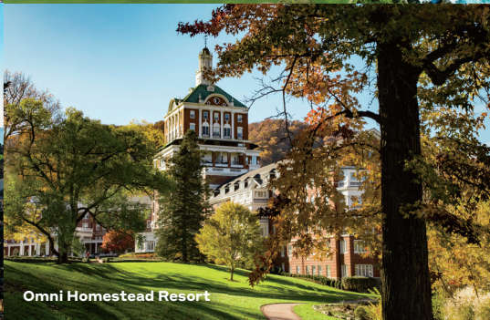
Omni Homestead Resort