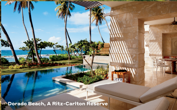
Dorado Beach, A Ritz-Carlton Reserve