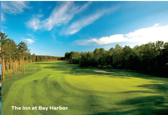
The Inn at Bay Harbor