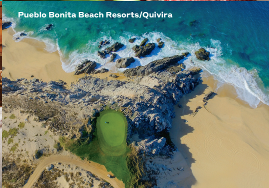
Pueblo Bonita Beach Resorts/Quivira