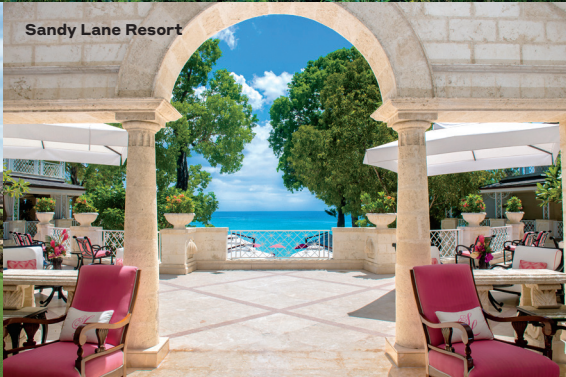
Sandy Lane Resort