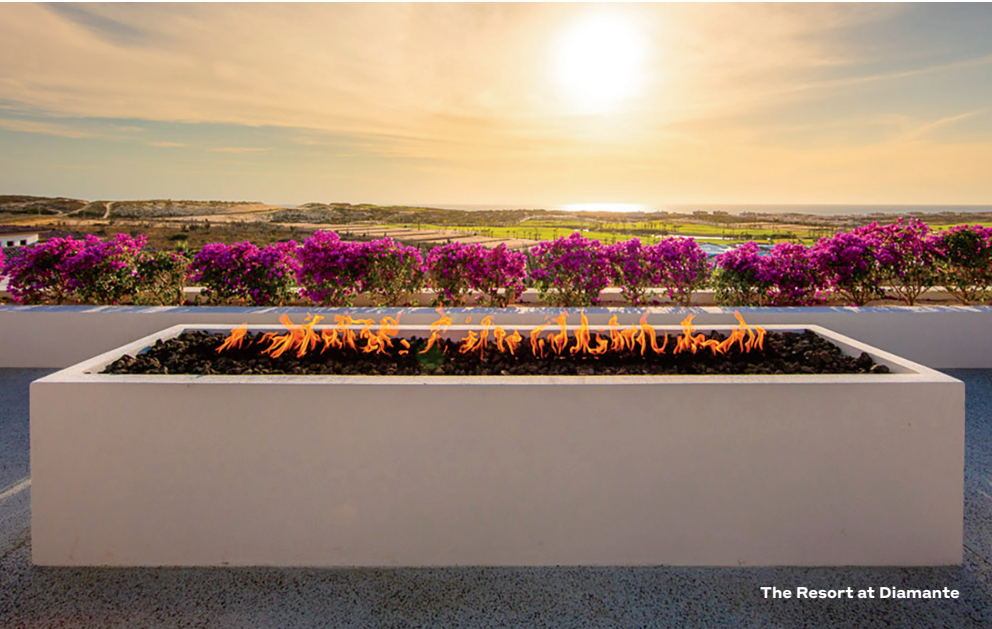
The Resort at Diamante

Best time to go: For best course conditions, tee it up in late March and early April (right after The Players Championship); lowest rates can be found during the sticky summer months. Daily stay-and-plays start at: $575. Golf experience: Play where the pros play at TPC Sawgrass Stadium Course, but don't overlook the adjacent Valley Course, also by Pete Dye. Best non-golf amenity: The 20,000-square-foot spa. While you're there: The World Golf Hall of Fame is just 30 minutes