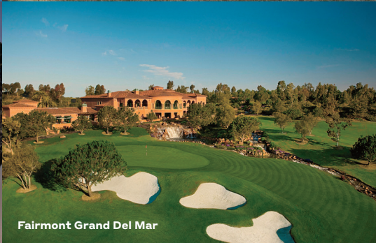
Fairmont Grand Del Mar