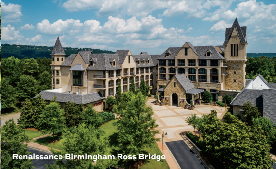
Renaissance Birmingham Ross Bridge