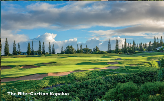
The Ritz-Carlton Kapalua