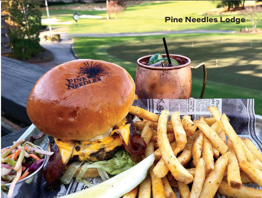
Pine Needles Lodge

south in St. Augustine. Insider tip: Guests have the exclusive opportunity to book a tee time up to a year in advance at TPC Sawgrass. Also good for: General Excellence marriott.com (904) 285-7777