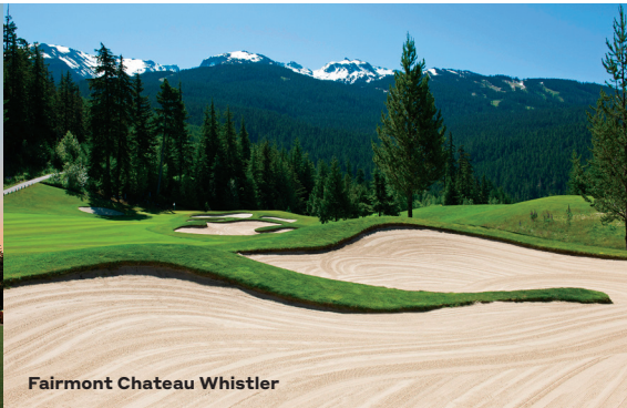
Fairmont Chateau Whistler