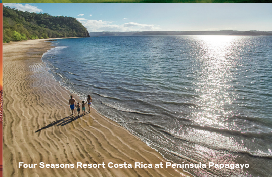
Four Seasons Resort Costa Rica at Peninsula Papagayo