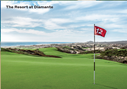
The Resort at Diamante