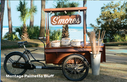
Montage Palmetto Bluff