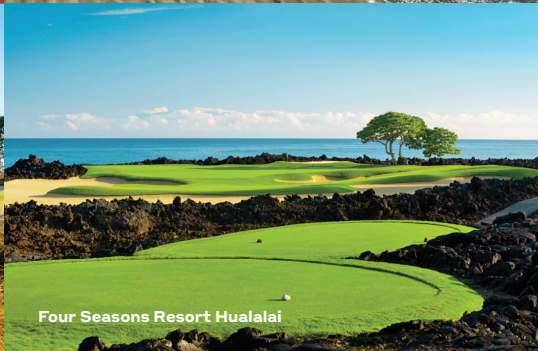
Four Seasons Resort Hualalai