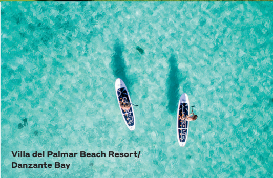
Villa del Palmar Beach Resort/ Danzante Bay