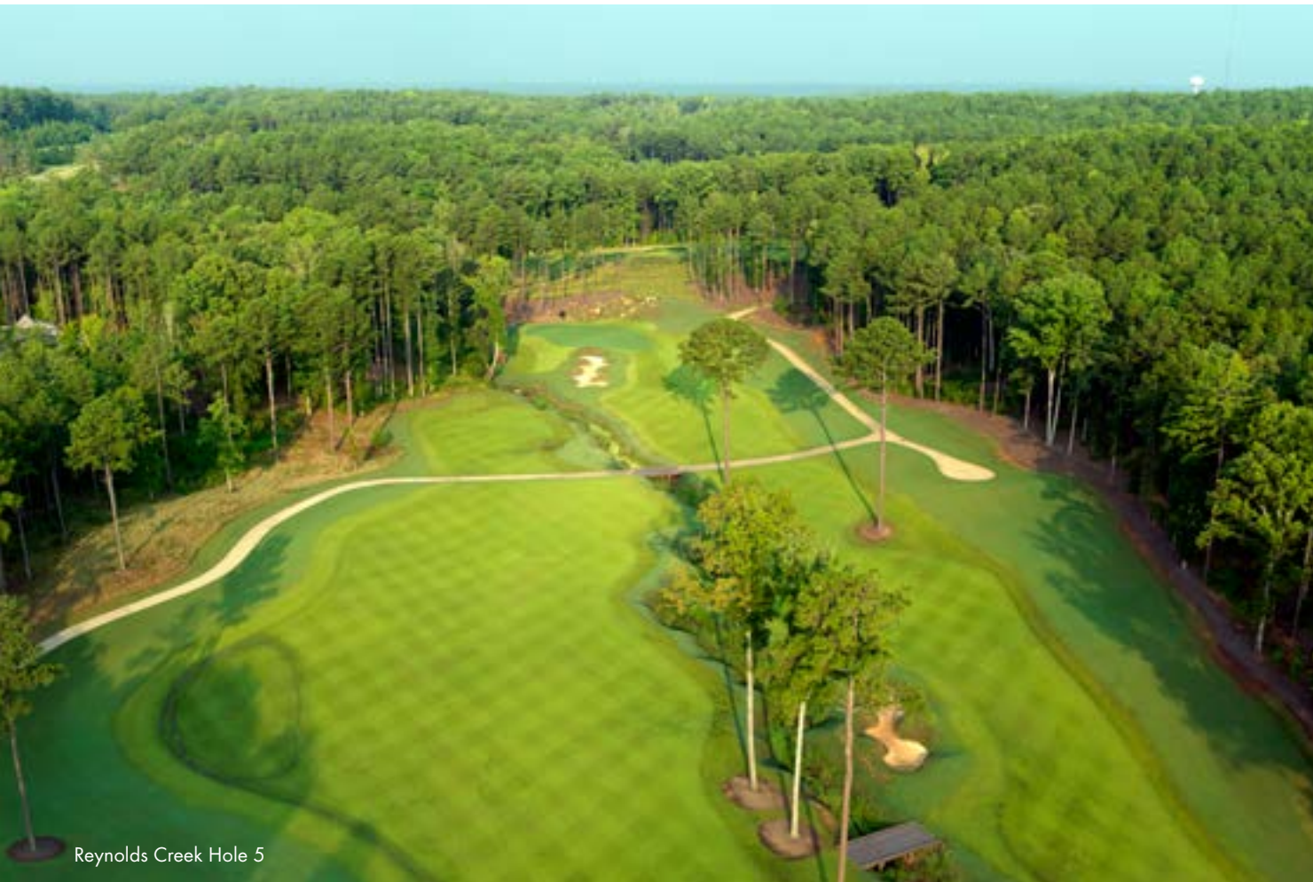
Reynolds Creek Hole 5

The National has three nines designed by Tom Fazio, all featuring significant changes in elevation, some as great as 60 feet. The Ridge and Bluff nines were the original 18 holes in