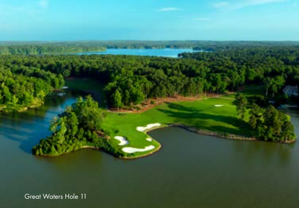
Great Waters Hole 11