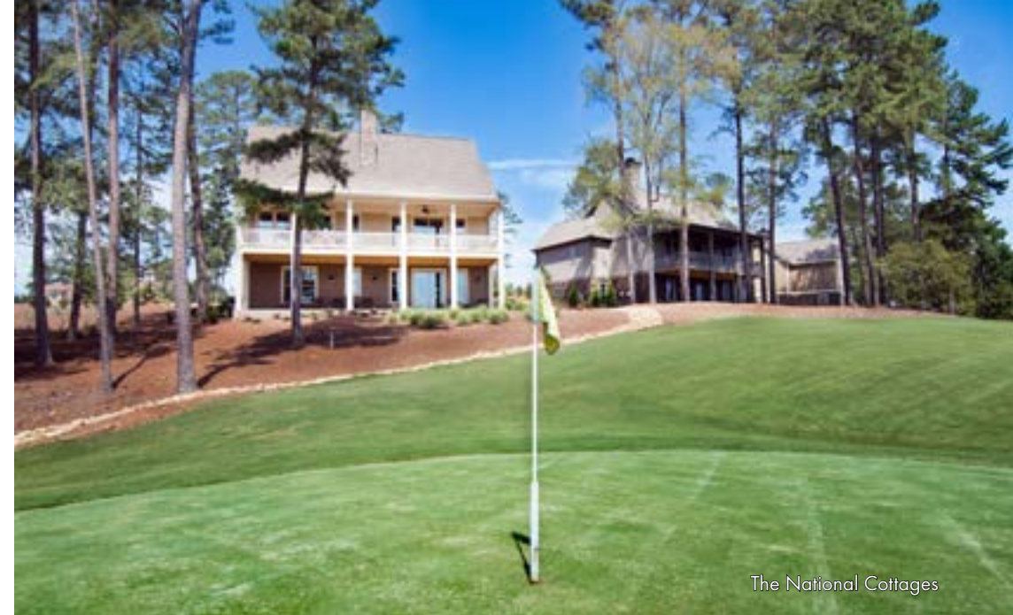
The National Cottages

Cupp was brought back to design The Preserve, with U.S. Open champions Fuzzy Zoeller and Hubert Green adding their insight. Updated three times