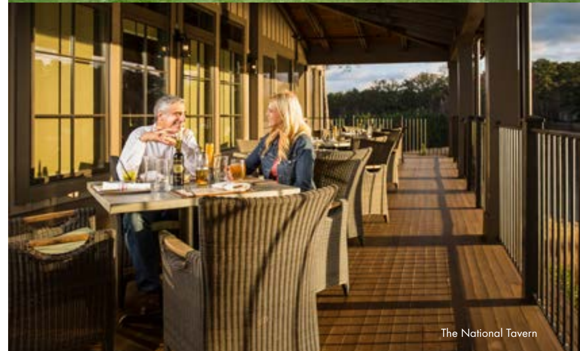
The National Tavern