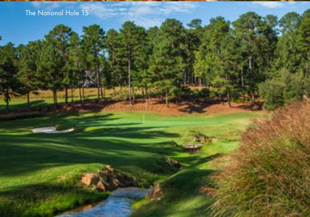
The National Hole 15