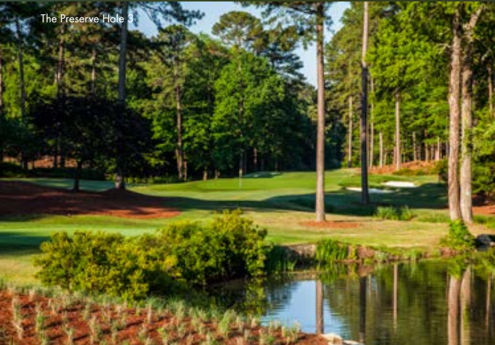
The Preserve Hole 3