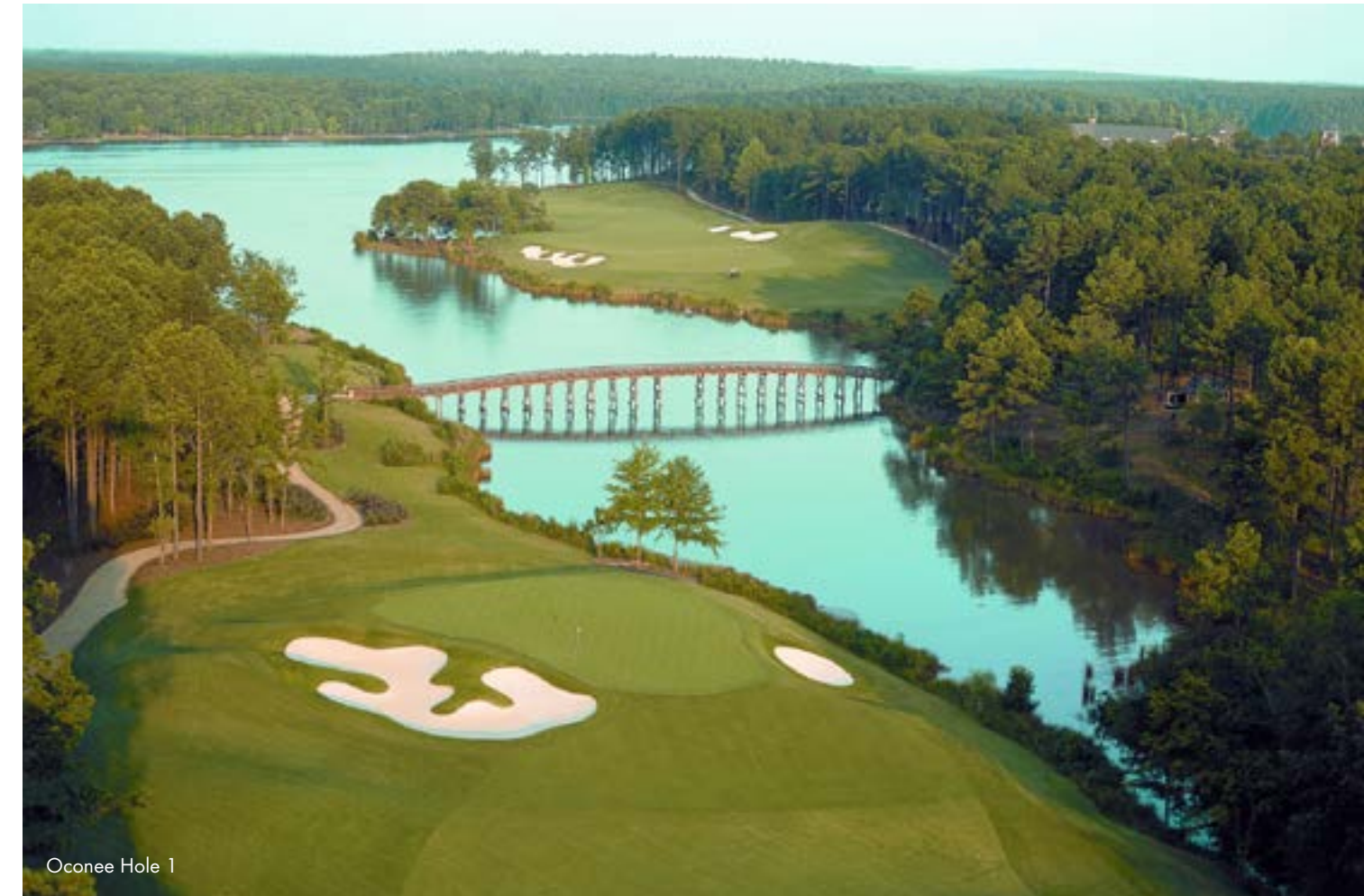
Oconee Hole 1

It’s a place where an overcoat is rarely needed. Weather records for Greensboro, the nearest town, show that August generally sees temperatures averaging in the mid 80s. Through mid-November,