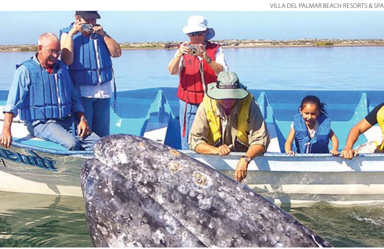
Whale watching on the Sea of Cortez.