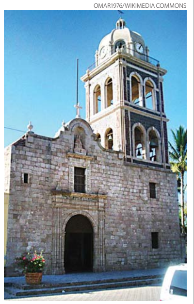
The Mission of Our Lady of Loreto, founded in 1697. Loreto was the first successful Jesuit mission and Spanish town in Baja California.

Over 900 types of fish inhabit the azure blue water along with whales, sea lions, and dolphins.