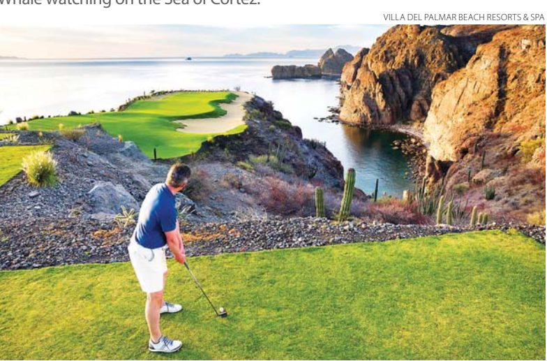
Hole 17 at Villa del Palmar's Danzante Bay Golf Course.

even see grey whales migrating and giving birth. Only licensed guides are allowed on the water with their panga boats during the season. Seeing these beautiful creatures up close is truly memorable.